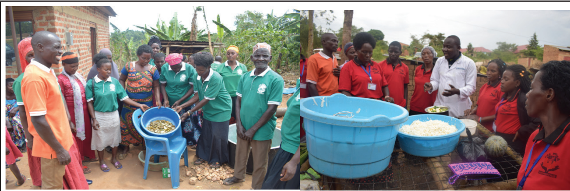
Farmers spreading cassava chips on solar dryer trays