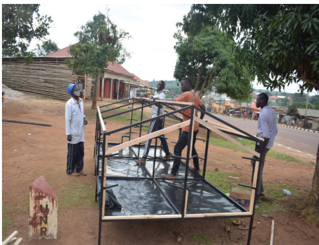
Youth retooling on fabricating solar dryer at Gomba

Youth were guided to retool their skills – i.e. to improve, refine, and adapt their skills towards developing/fabricating and deploying climate action solutions of solar dryers, and decentralise/deploy the same to communities through the VSLAs structure. Youth engaged were unemployed youth, and they were guided in fabricating solar dryers to enable the decentralisation of those dryers to the county and village level. By thins, they enhance experience building opportunities to drive climate action enterprises while also curbing post-harvest losses of cassava and other agriculture products and driving the implementation of NDCs and NDP3. Through this skills retooling and guidance to engage the community as beneficiaries and markets, an approach called Innovative volunteerism retooled the skills of 4 youth in fabricating and maintaining solar dryers. These youth were then guided to work with communities and decentralise the dryers through the structure of communal cooperatives.