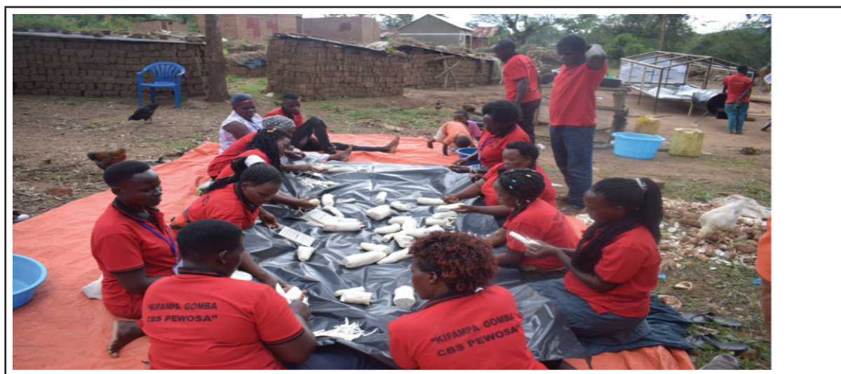
Figure 7 solar drying method of drying agriculture commodities trained to VSLA beneficiaries