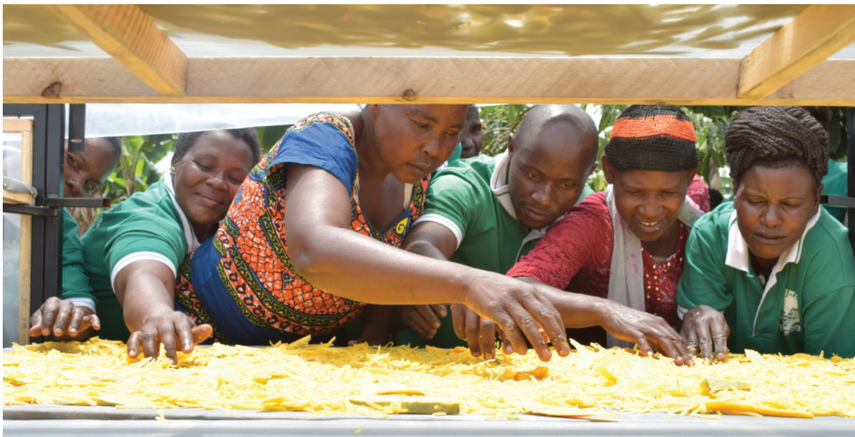
Figure 8 Kokoma Women group spreading pumpkin chips in the solar dryer