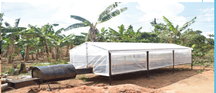
solar dryer fabricated by the youth of Gomba installed at Kakoma Women & Men Group