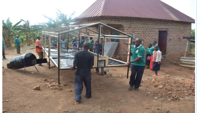
Youth offloading solar dryer at Kakoma Women & Men group