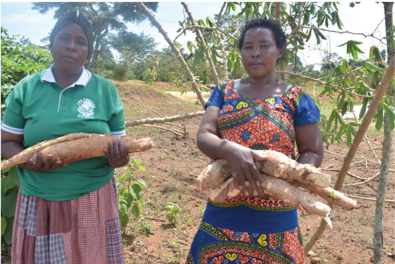
figure 2 cassava farmers holdings some of cassava roots harvested