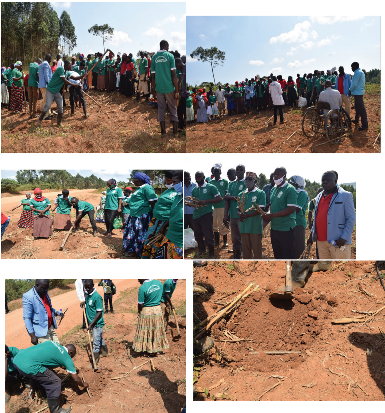
Gomba CBS PEWOSA Village saving and loans associations of Tweekwembe Kakoma Women and Men group. Planting NAROCAS1 variety on their 9 acres

A total of 140 farmers were engaged, and the gender distribution was 57.15% female and 42.85%, male. In addition, only two village savings and Loans Association of Kifamba Nezikokolima Cbs Fans Clubs and Tweekembe Kakoma Women and Men group were trained