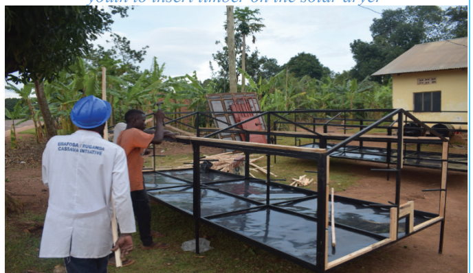
UNEP-EBAFOSA Uganda trainer instructing youth to insert timber on the solar dryer