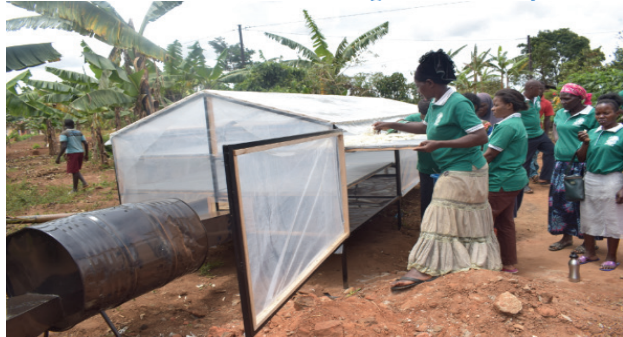
Women in Gomba VSLA using their solar dryer