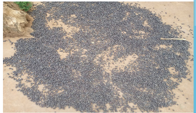
(D) Drying of coffee below is on polythene and tarplines