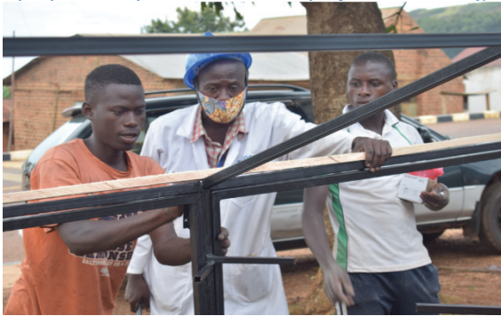
Tightening edges of the solar dryer to allow proper transportation and UV polythene dressing