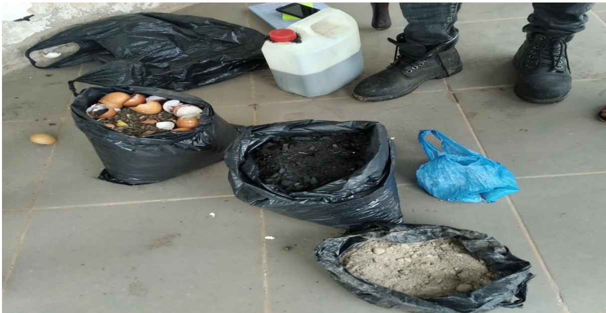
Basic ingredients for making bio-fertilizer

The plant tea has two years life span undiluted and comprised of the three main nutrients; Nitrogen, Phosphorus and Potassium.