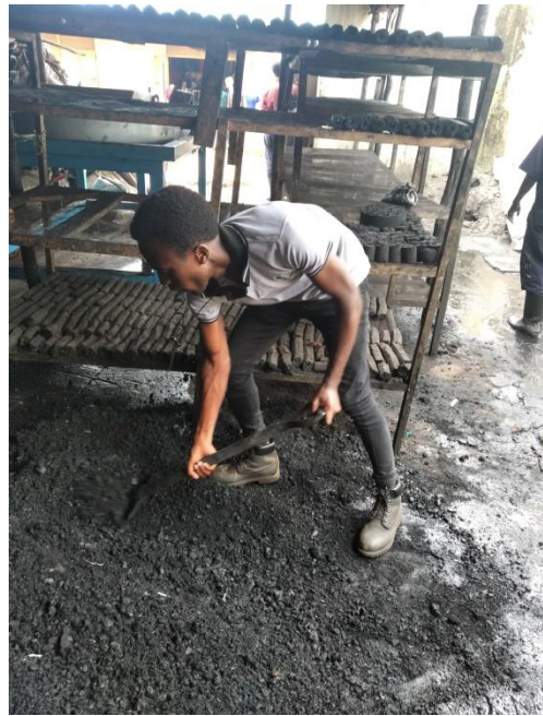
Mixing of the carbonized material