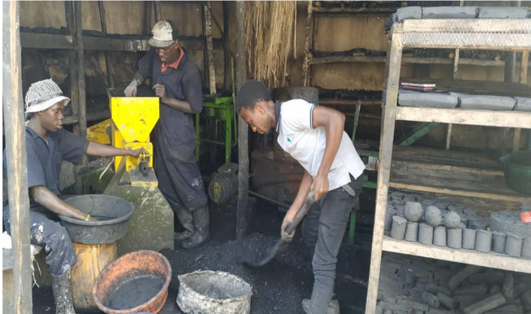
Filling the electrical machine with material during the production process

Electrical briquette making; this involved use of an electrical powered machine to make briquettes. The machine is fed with the carbonized material into the automated machine which compacts them and extrudes the briquettes. The end product from this particular machine is of good quality compared to the manually produced products.