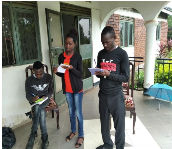
Team receiving introduction and theoretical background of Biochar