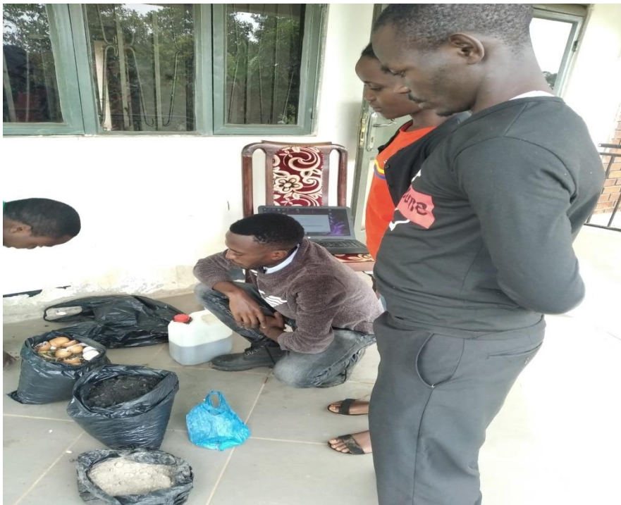
Team make a close observation of the materials for making biofertilizer