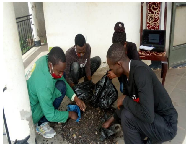
Team actively taking part in mixing bio-fertilizer making ingredients