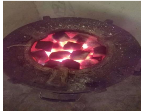
Initial lighting and ignition done in open air