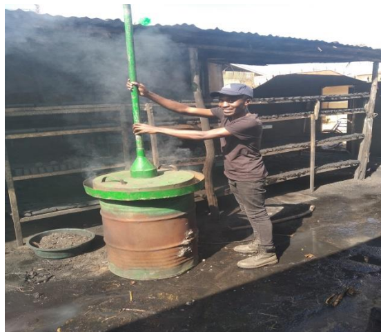
Carbonising the material using a carbonising drum