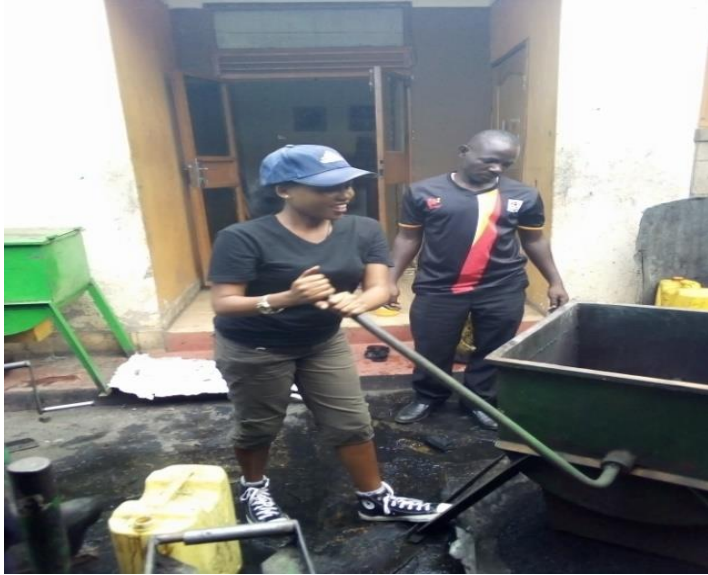
Crushing the carbonized material.