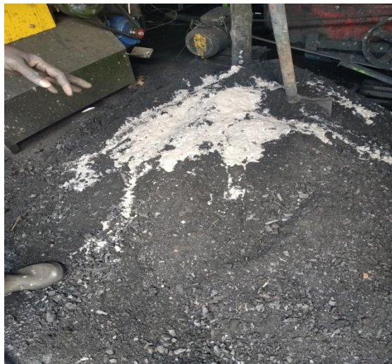
Mixing of the material (adding binder and filler)