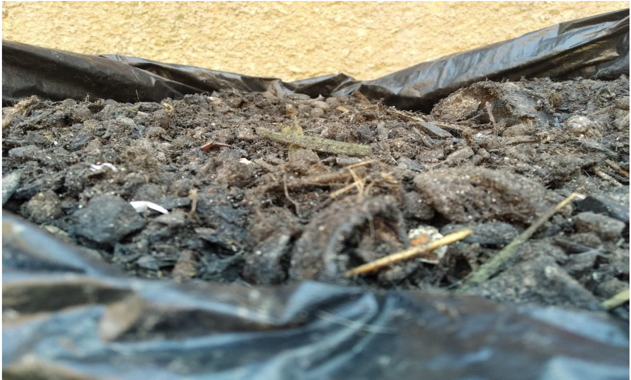
Sample of the biofertiliser made after the training

At the end of the training, the team was able to make 25kg of bio-fertiliser.