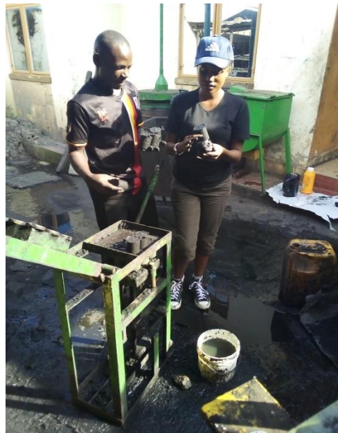
Molding of briquettes using manual presser machine