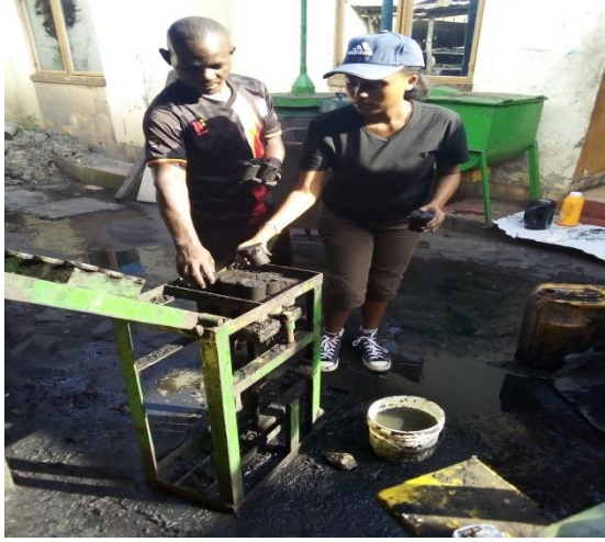
Actual production of briquettes