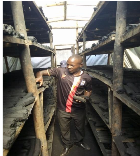
Team member arranging briquettes on the decks