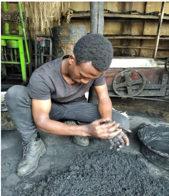
Molding of briquettes using hands

Manual briquette making; this involved use of manual methods to make briquettes. This includes use of hands to mold ball like briquettes and manual machine to mold cylindrical briquettes. Organic waste was carbonized, crushed and mixed with cassava flour/molasses before molding it into briquettes.