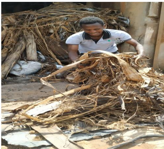
Sorting of the material for carbonizing

This involved turning waste into carbon. Banana waste was used in the training, however other kinds of agricultural and biomass waste are also used following the same process. A challenge in carbonizing some material for example saw dust was cited. An assorted drum carbonize was used during the training and the whole procedure was well mastered.