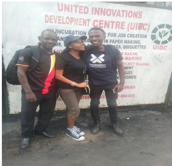
Team that undertook training of fuel briquettes